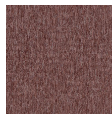
Blossom 83870 LRV 11