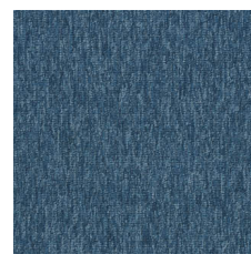
Cadet 83440 LRV 11.3