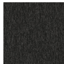
Flint 83549 LRV 3.6